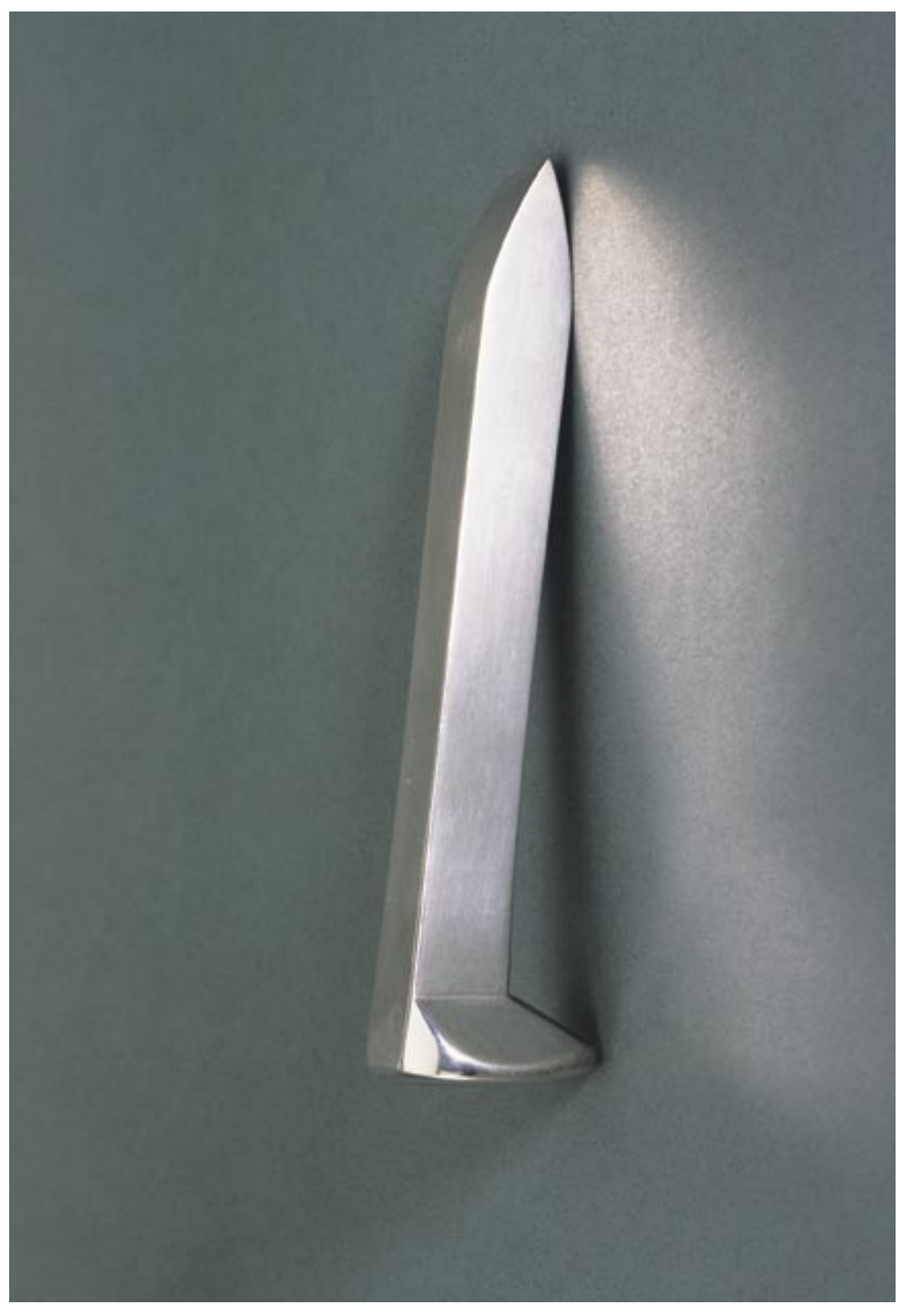
Duhme & Co., Spike, ca. 1879-80, Gift of the Trustees of the Southern Railroad, 1884.309