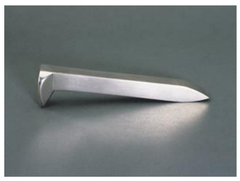
Duhme & Co., Spike, ca. 1879–80, Gift of the Trustees of the Southern Railroad, 1884.309

"In all large cities it appears that some business houses become so thoroughly noted and prominent that they become features of the city itself. Such a house is that whose name heads this article, and