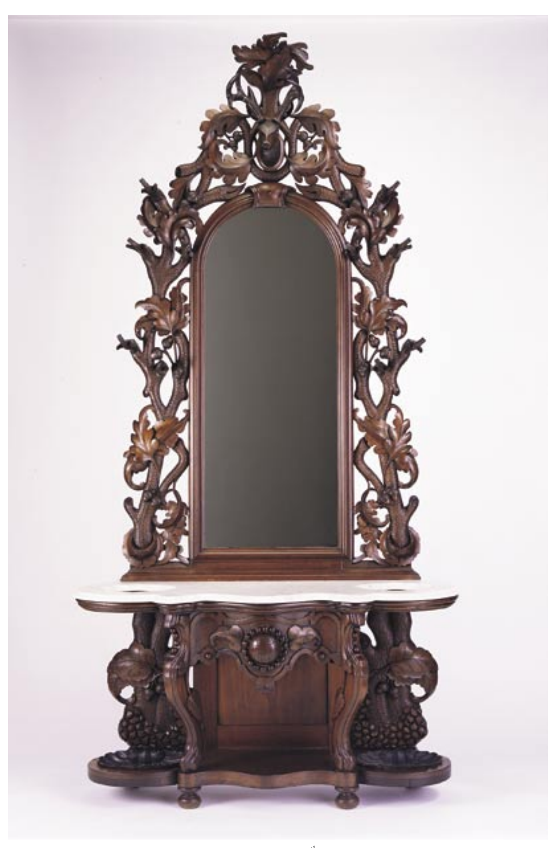
Attributed to Mitchell & Rammelsburg Furniture Company, Hall Tree, mid-19<sup>th</sup> century, Museum Purchase: Gloria W. Thomson Fund for Decorative Arts, Mark Herschede Endowment, Hannah Rauh Fund, and miscellaneous Decorative Arts funds, 2001.166a–e