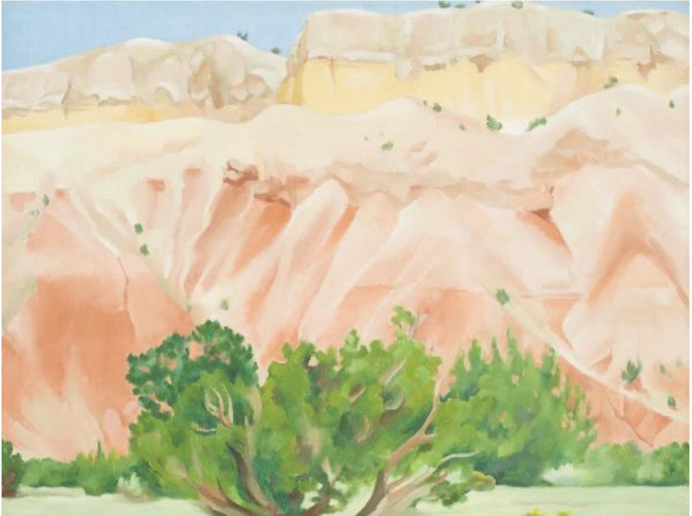
Georgia O'Keeffe My Backyard, 1943 Oil on canvas