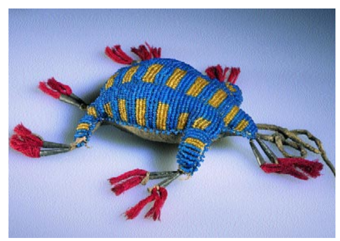
Turtle Amulet, Cheyenne, 19th century, Gift of General M.F. Force, 1894.102