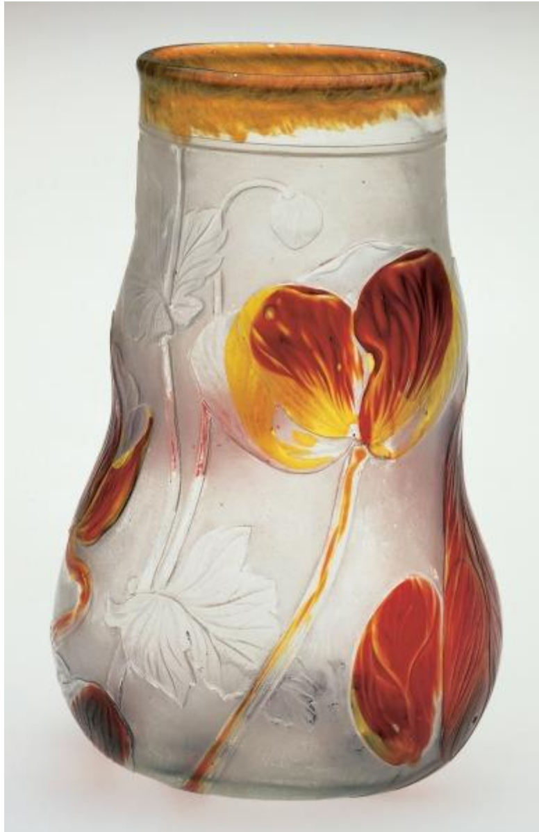
Tiffany Glass & Decorating Co. (American, estab. 1892, closed 1902), Louis Comfort Tiffany (American, b.1848, d.1933) Vase, 1895 Corona/New York/United States H.7 3/8 in. (18.7 cm); Diam.4 7/8 in. (12.4cm) Favrile cameo glass Gift of Alfred Traber Goshorn; 1897.135